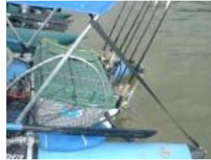
JC's Large Livewell